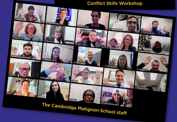
The Cambridge Matignon School staff