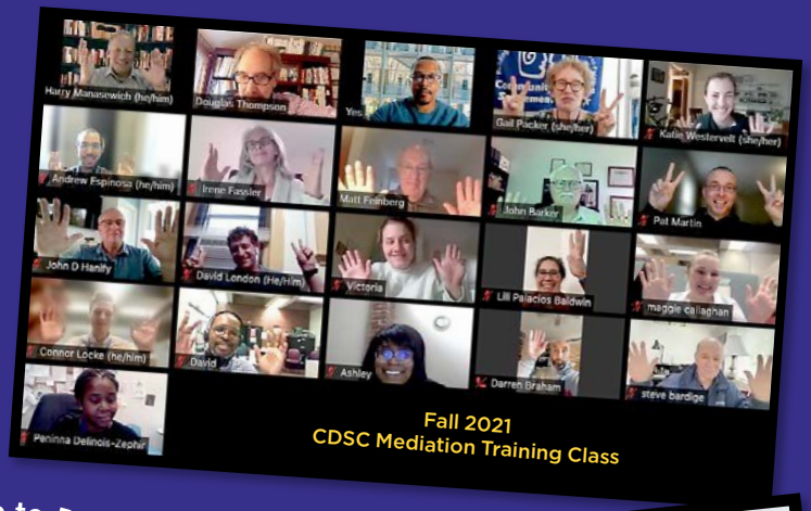
Fall 2021 CDSC Mediation Training Class