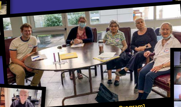
TAP [Tenant Assistance Program] Watertown Housing Authority