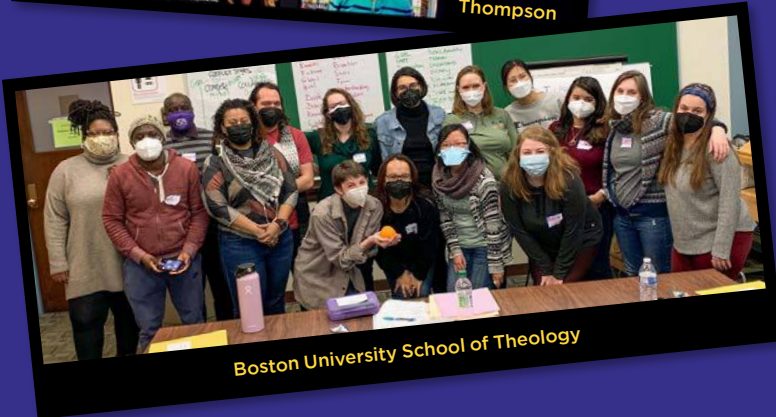
Boston University School of Theology