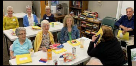
TAP [Tenant Assistance Program] Hingham/Lincoln School Apts