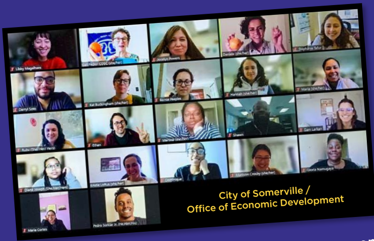
City of Somerville / Office of Economic Development