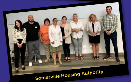
Somerville Housing Authority